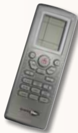
For ceiling cassette

Operation is controlled by a fully featured wireless remote. Intuitive design makes it easy to select the operational mode. For multi-zone units, one remote is included for each indoor unit.