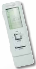
For high wall mount

Capacities for InverterFlex models range from 18,000 BTUH to 42,000 BTUH, with indoor air handlers sized from 9,000 to 24,000 BTUH per zone, depending on the model selected.